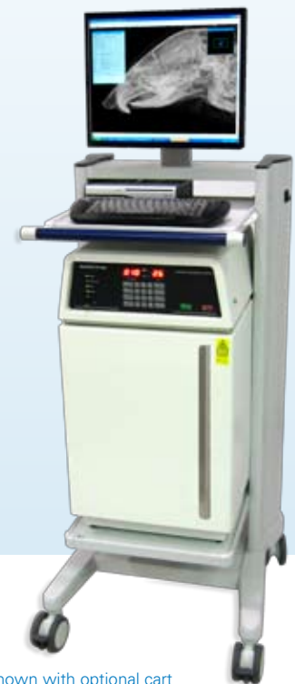
MX-20 shown with optional cart