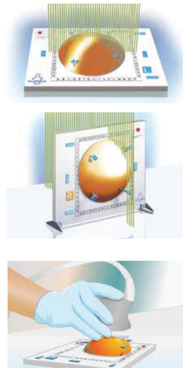
Easily secure and orient specimens with KliniTray.

The air and water-tight container secures the specimen during preparation, examination and transportation. Specially designed safety pins also stabilize the specimen in an upright position.